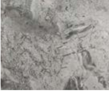
Breccia Nuvole Marble